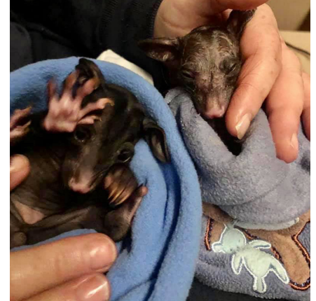
Brush-tail possum joeys - Tasmanian Animal Rescue, Rehabilitation, & Education Services