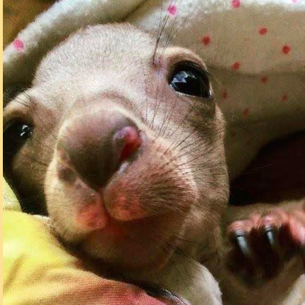
Felix, an eastern grey joey, enjoying a snuggle - Western QLD Wildlife Rehabilitation